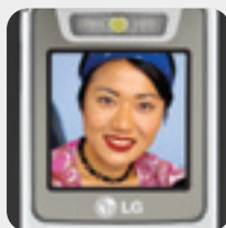
Large External Color LCD for Self-Portrait Capability